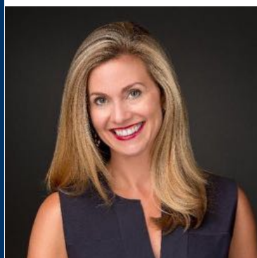
eSafety Commissioner, Julie Inman Grant

The Office of the eSafety Commissioner is the official Committee for Safer Internet Day in Australia — responsible for driving the initiative nationally.