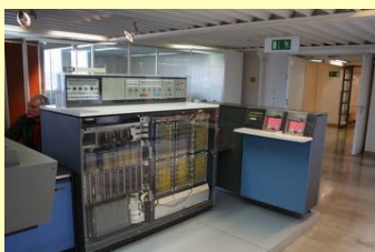
IBM 360 Computer c. 1960